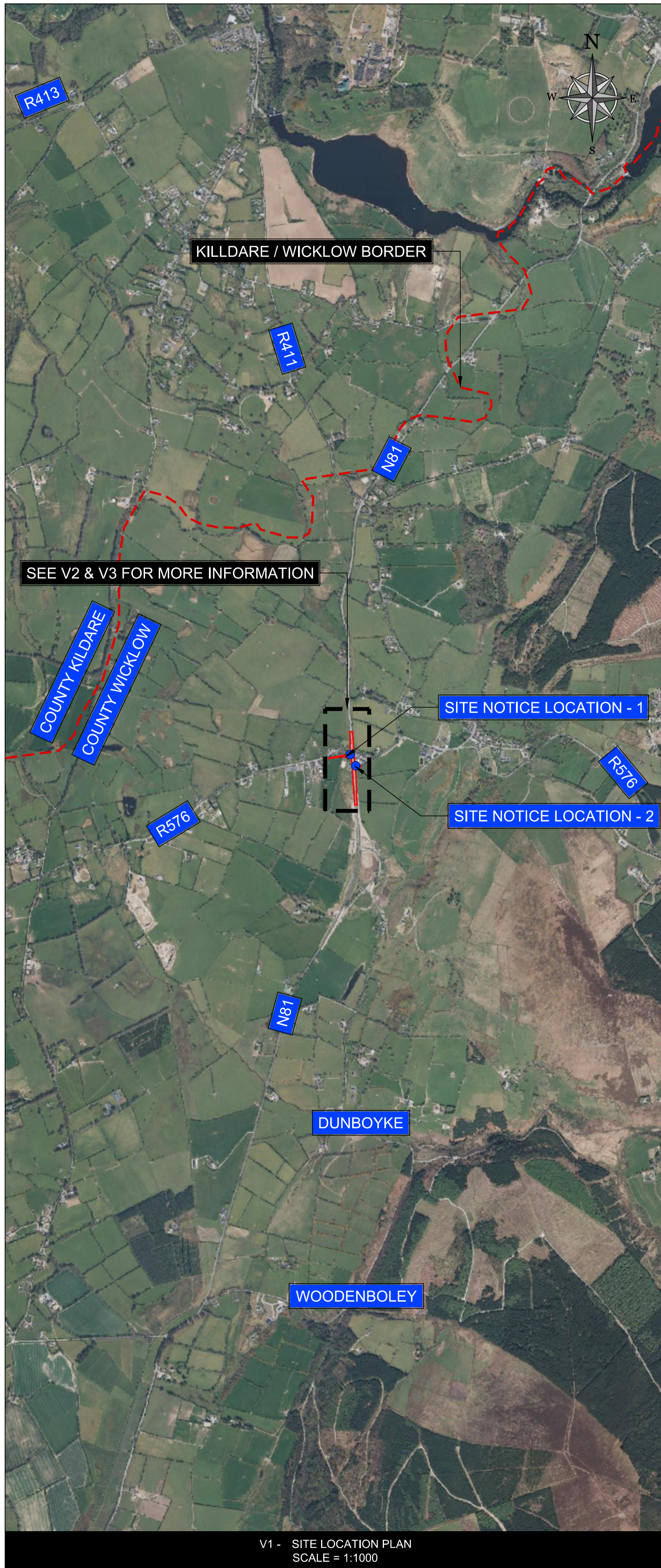
V1 - SITE LOCATION PLAN SCALE = 1:1000